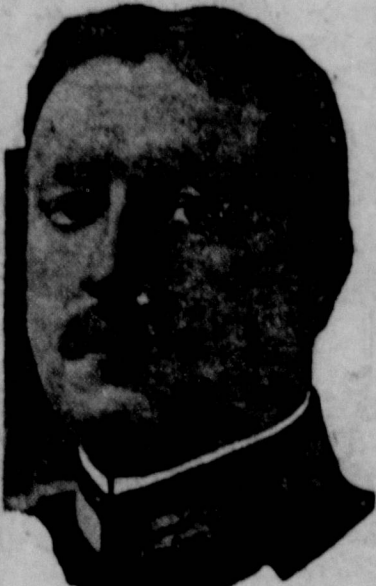
MAJOR ARCHIBALD BUTT, President Taft's Aide, Who Went Down With the Titanic