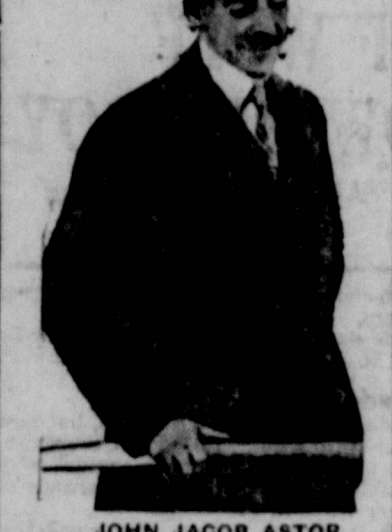
JOHN JACOB ASTOR